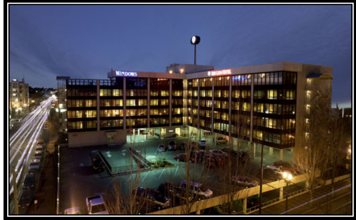
Red Lion Portland Convention Center 1021 NE Grand

Our hotel, the Red Lion Hotel Portland - Convention Center is located in the heart of Portland's Lloyd District in the core of the city. Along with being across the street from the Oregon Convention Center (and the Convention Center light rail station), the Red Lion is within walking distance of numerous restaurants and the (large) Lloyd Center shopping center. The facility is located within Portland's "Fareless Square", a free bus & light rail zone that also includes Portland's downtown shopping district (as well as Powell's City of Books*). The room rate is just $69/night (plus tax).