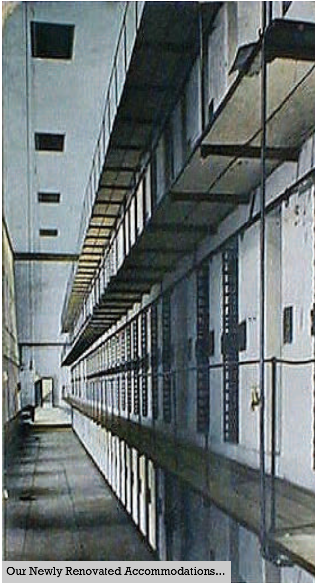
Our Newly Renovated Accommodations...